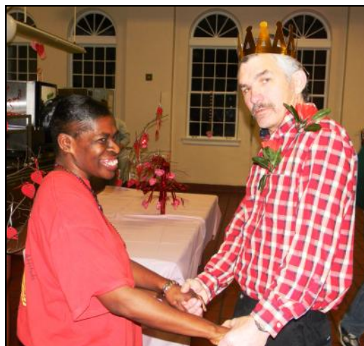
The Valentine's Dance, which was held Feb. 17th, is one of most anticipated events of the year! Most individuals were content to dance the night away to some of their favorite tunes.