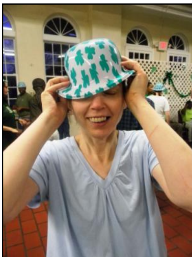
Party hats were plentiful at the St. Patrick's Day party held on March 17th. Everyone enjoyed a good meal and a night of socializing and dancing.