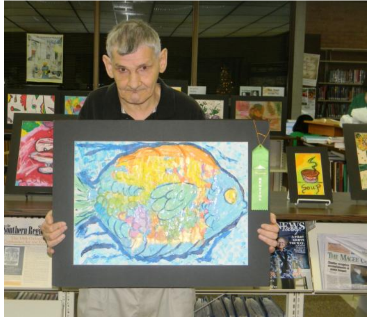
An individual receiving Boswell services is pictured with his award winning drawing on display with other individuals works of art at Magee’s library.

The artist pictured at right was the recipient of an Honorable Mention Award.