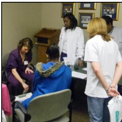
BRC Wellness.....Page 6