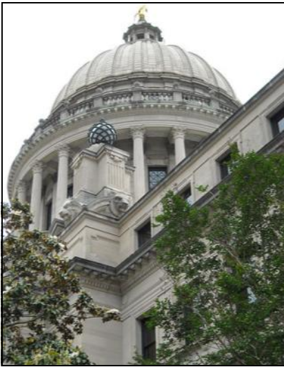
March 22nd IDD awareness at the Capitol