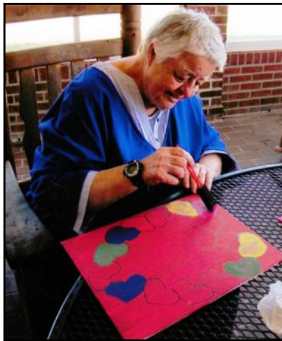
Artwork donated.....Page 3