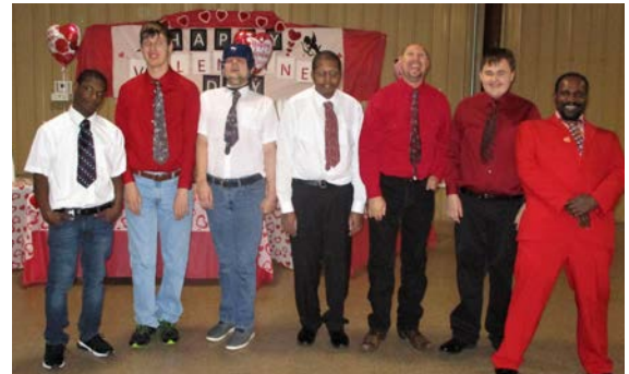
The guys from Ridgeview dressed up in their finest to impress the ladies at the Valentine's dance.