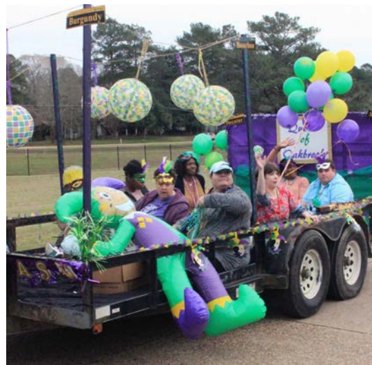
The "Queens of Oakbrook" had a blast decorating and riding on their float, complete with NOLA street signs.