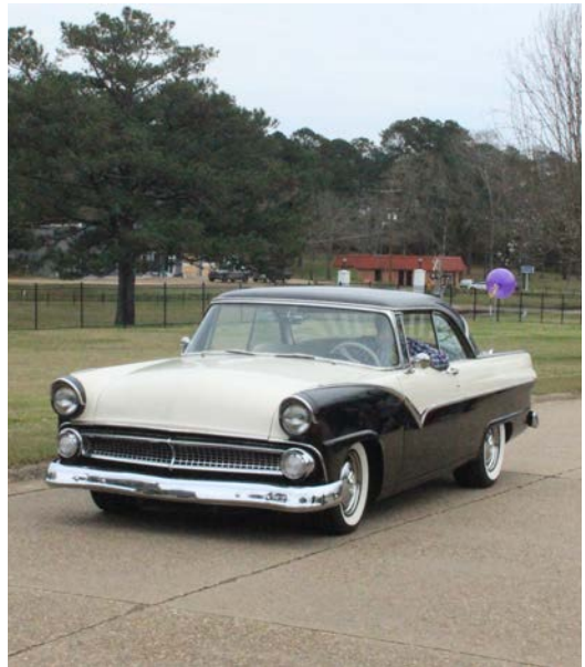
Antique car owners from a car club in Star drove down to ride in the parade.