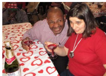
Toasting each other with sparkling grape juice was a treat for individuals.