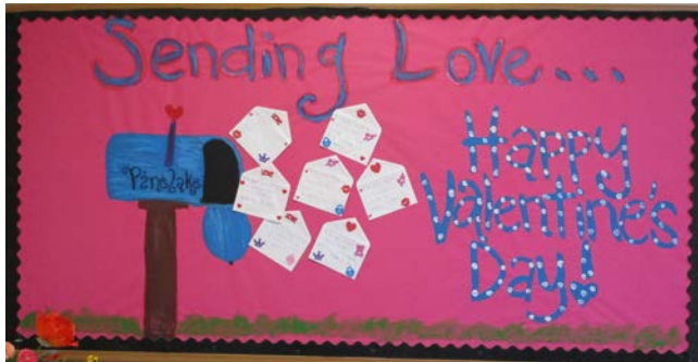
Creative bulletin boards, red hearts and streamers brightened up campus units and buildings during February in honor of Valentine's.