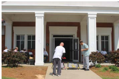
Despite not being able to leave campus for outings or recreational events, individuals at Fairview on campus managed to enjoy the fresh air and sunshine while playing a game in front of their building.