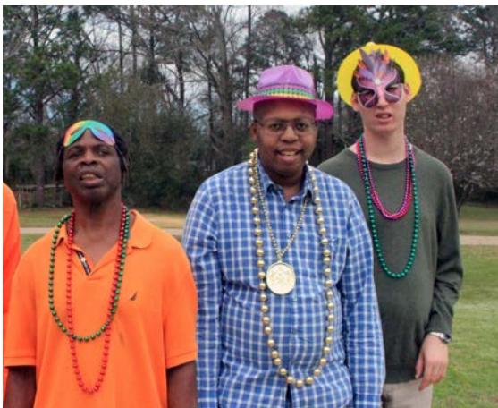
The Ridgeview guys were lined up early and waiting for the parade to begin. Grabbing beads, Moon pies and other treats made the parade even more fun.