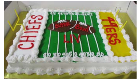
It wouldn't be a Super Bowl without a cake decorated with the two teams' colors and symbols. Despite their allegiances, both sides of the cake disappeared before the game was over.