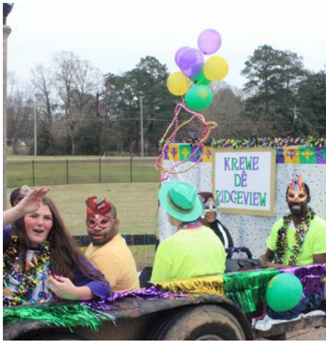
The guys at Ridgeview enjoyed helping decorate and then ride on their float with their friends.

Here are just a few photos of the campus Mardi Gras parade organized by Recreation: