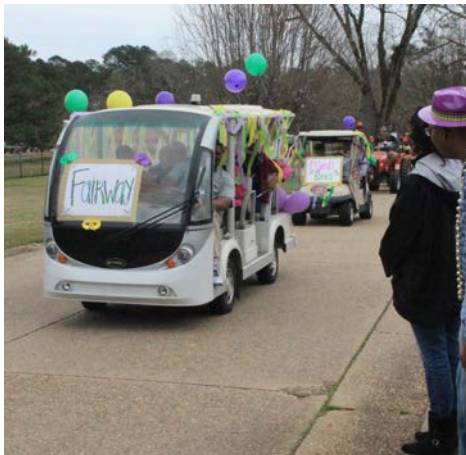
Fairway borrowed the star cart and decorated it in Mardi Gras colors.