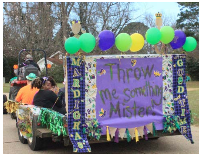
Pinelake used the "Throw me something, mister!" theme on their float and followed it up by throwing lots of beads and coins.