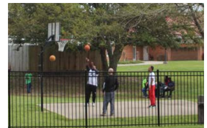
A spirited game of basketball kept the guys at Ridgeview entertained and provided the chance to get some exercise.