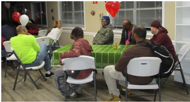
Most of the guys (and a few ladies, too) gathered in the Rainy Day Room to watch Super Bowl LIV. Judging from the table décor, this group was rooting for the Kansas City Chiefs.