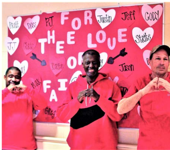
The guys at Fairway wore red and even showed off their self-made "hearts" on Valentine's Day.