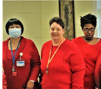
As usual, the Oakbrook ladies all dressed in red early and were ready for their Valentine's party well before the festivities started. Staff joined in by wearing red for Heart Month as well as the day of love.