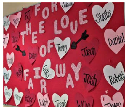
As usual, the bulletin boards and other areas were decorated with hearts and other festive Valentine's décor.