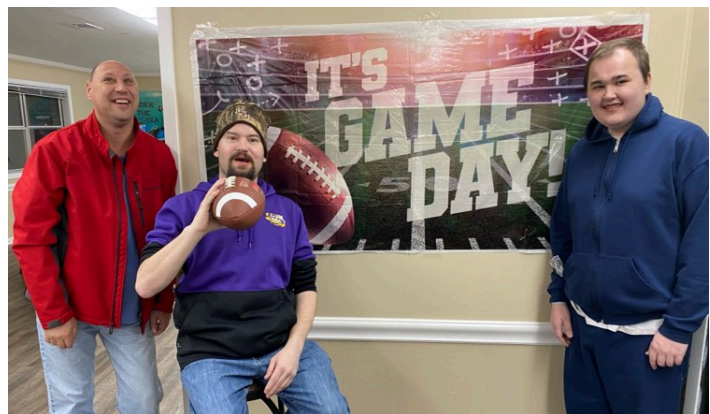
Both the ladies and men enjoyed getting together in the Rainy Day room, where tailgating snacks were available while the Super Bowl was being played.