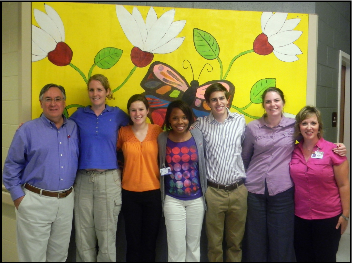
UMMC Center for Bioethics Summer Fellowship VDT training.