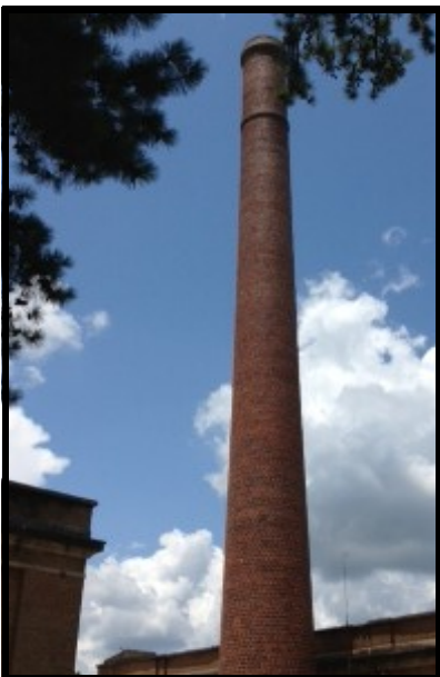
The smoke stack as it stood for decades