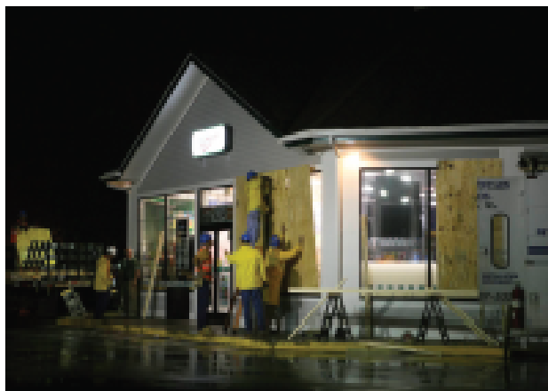
American Red Cross