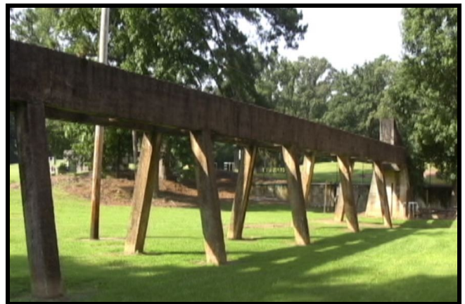
These are the remnants of the train track which brought the coal .