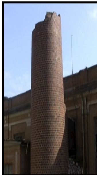
The smoke stack disappearing "brick by brick"