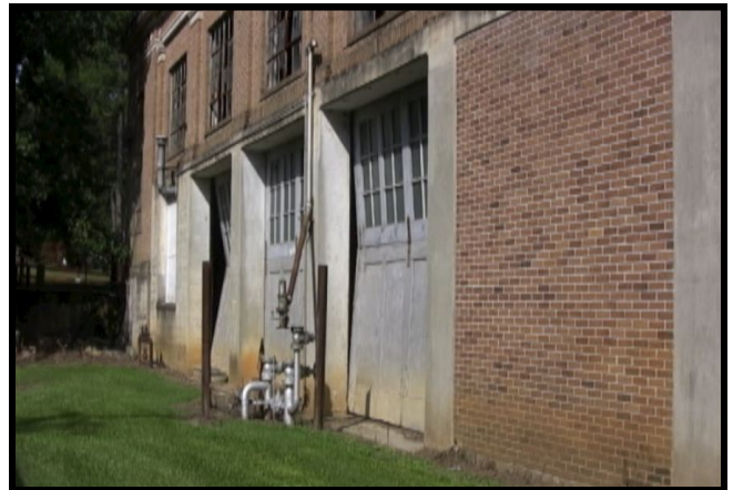
This is the rear entrance to the power plant where coal was taken to power the grounds.

Today, the smoke stack no longer stands. Starting the last week in July, it began to be demolished "brick by brick". For more information of the history of the smoke stack, power plant, or the Sanatorium campus, take a trip by the BRC museum. You're sure to find some treasures there.