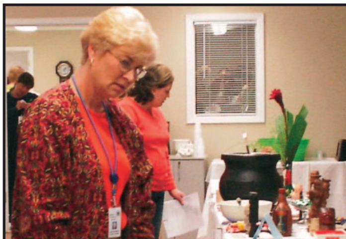
Employees learned interesting facts about ingredients contained in some of the native foods prepared.