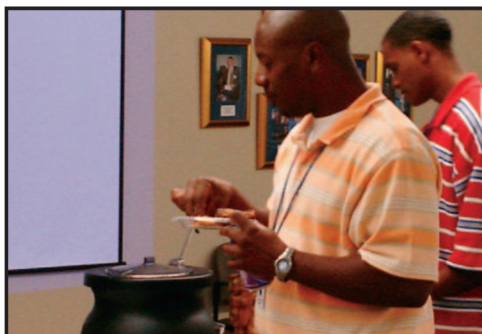
Red beans and rice originates in South America, but was definitely a Southern favorite with many Boswell employees.