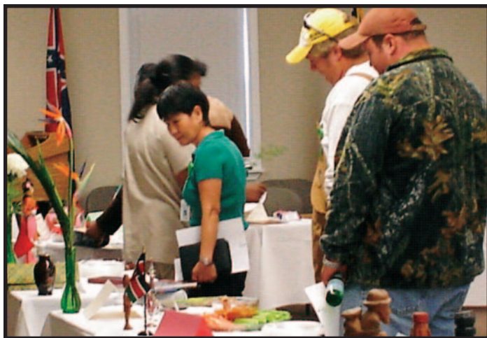
Employees view the various displays from different countries.