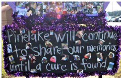
Above, the winner of the Paint It Purple decorations contest went to Pinelake for their photo collage to help others remember the important moments of their past.