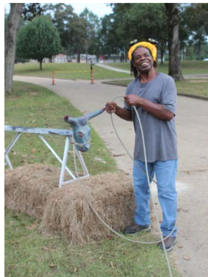
Roping the zombie bull was a thrill few individuals had ever experienced. A successful throw resulted in a prize.