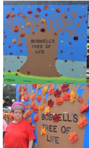
Placing a leaf containing their name on Boswell's Tree of Life was a thrill for participants.