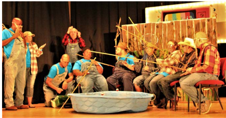
At right, some of the best skits from the TV show "Hee Haw" were revitalized by the team at Dream Extreme at Arts Fair.