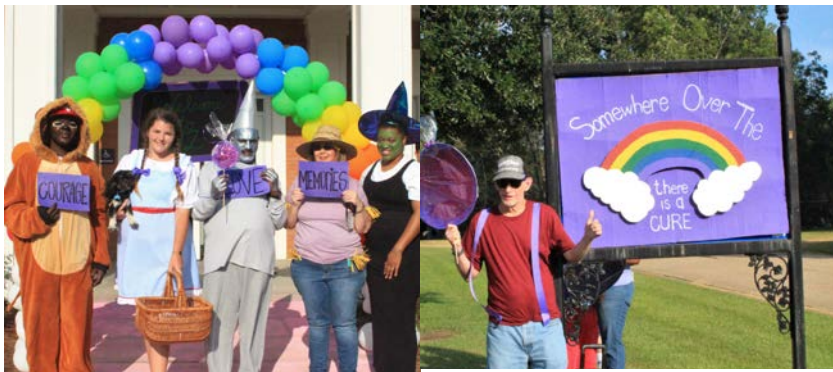
At left, Ridgeview's Wizard of Oz theme at Paint it Purple Parade was illustrated by staff in costumes and a yard sign with hopes for a cure for Alzheimer's.

Here are a few scenes from what turned into a very enjoyable fall!