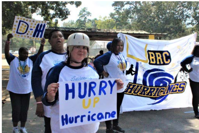
Boswell's cheerleaders were fired up and ready as they prepared to cheer on the Hurricanes at the annual Fall Ball Game.