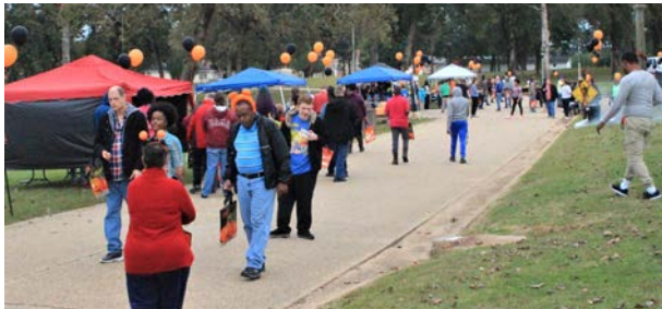
At the Fall Festival, tents filled with games, prizes and staff dressed in costumes awaited individuals as they made their way down the street.

Boswell's individuals celebrated the week prior to Halloween with a Fall Festival, followed by a Haunted House on the 31st. Organized by Recreation, the events were filled with surprises and enjoyed by all. Here are a few scenes from both events: