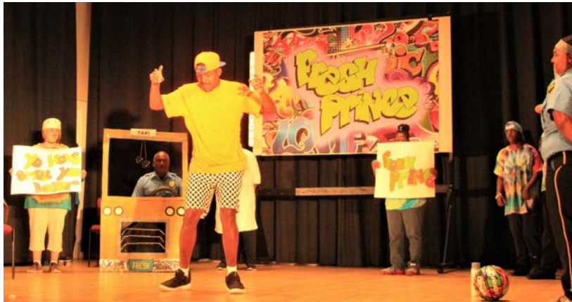
At left, The Fresh Prince of Bel Air was a popular Arts Fair skit. The team at the Bay Springs Group Homes worked hard to bring it to life.