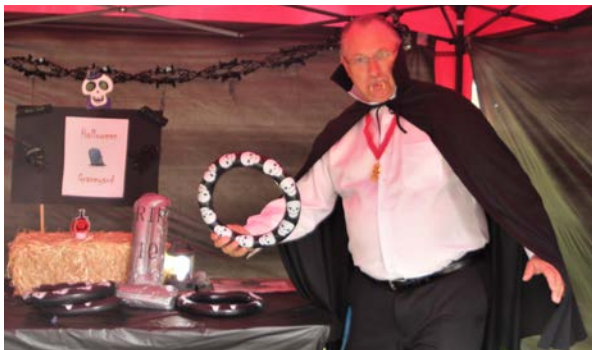
Throwing a ring over a "tombstone" resulted in a prize for the lucky winners.