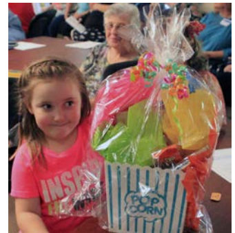
The smallest family member in attendance at the annual Friends and Family meeting was excited to win a door prize.