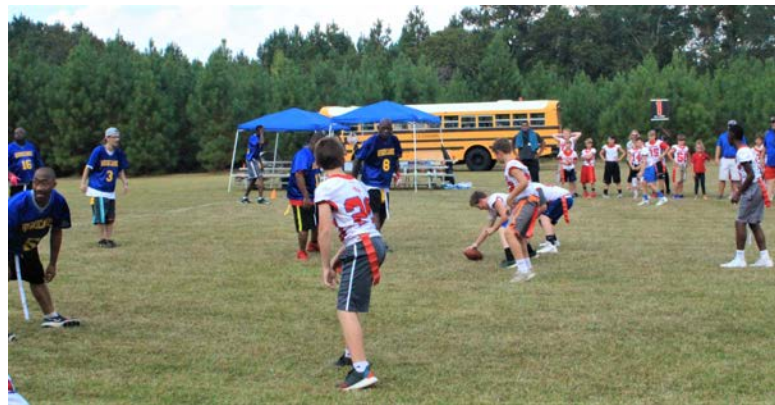
The Hurricanes' defensive line, left, gets ready for the Cougars' offensive game.