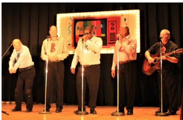
The guys of Fairway showcased their musical talents at Arts Fair by singing some recognizable songs from TV shows.