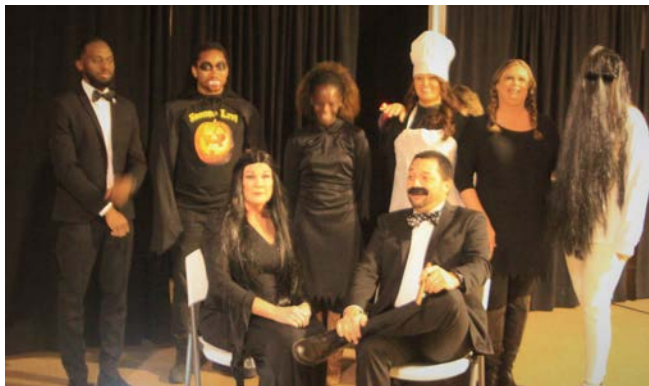
"The Family" posed for a group portrait before getting ready to greet the next group of individuals.