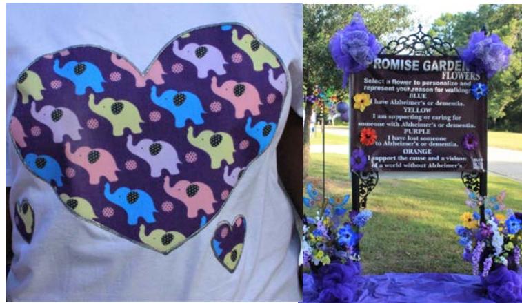
At right, Oakbrook's staff created a beautiful poem, gave out flowers to participants and decorated shirts for each of their individuals at Paint It Purple.