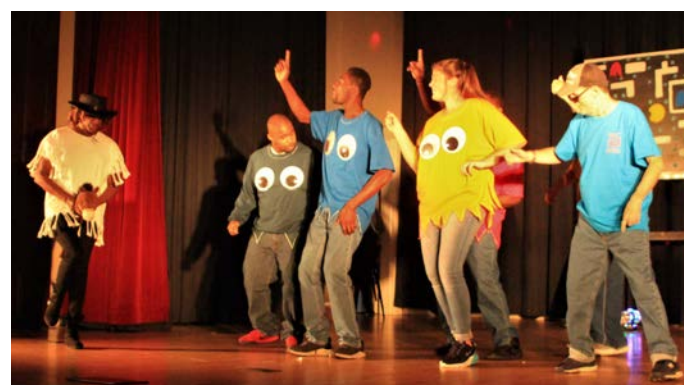
Memories of "Pac Man" were brought to life by the team at Ridgeview.