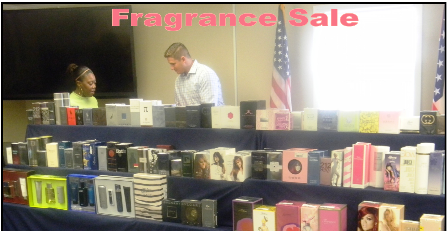
Boswell's Friends and Family Association benefited from the recent Fragrance/Handbag sale that was held August 19 th in the training center. Brands included Jessica Simpson, Michael Kors, Polo, BCBG to name a few.