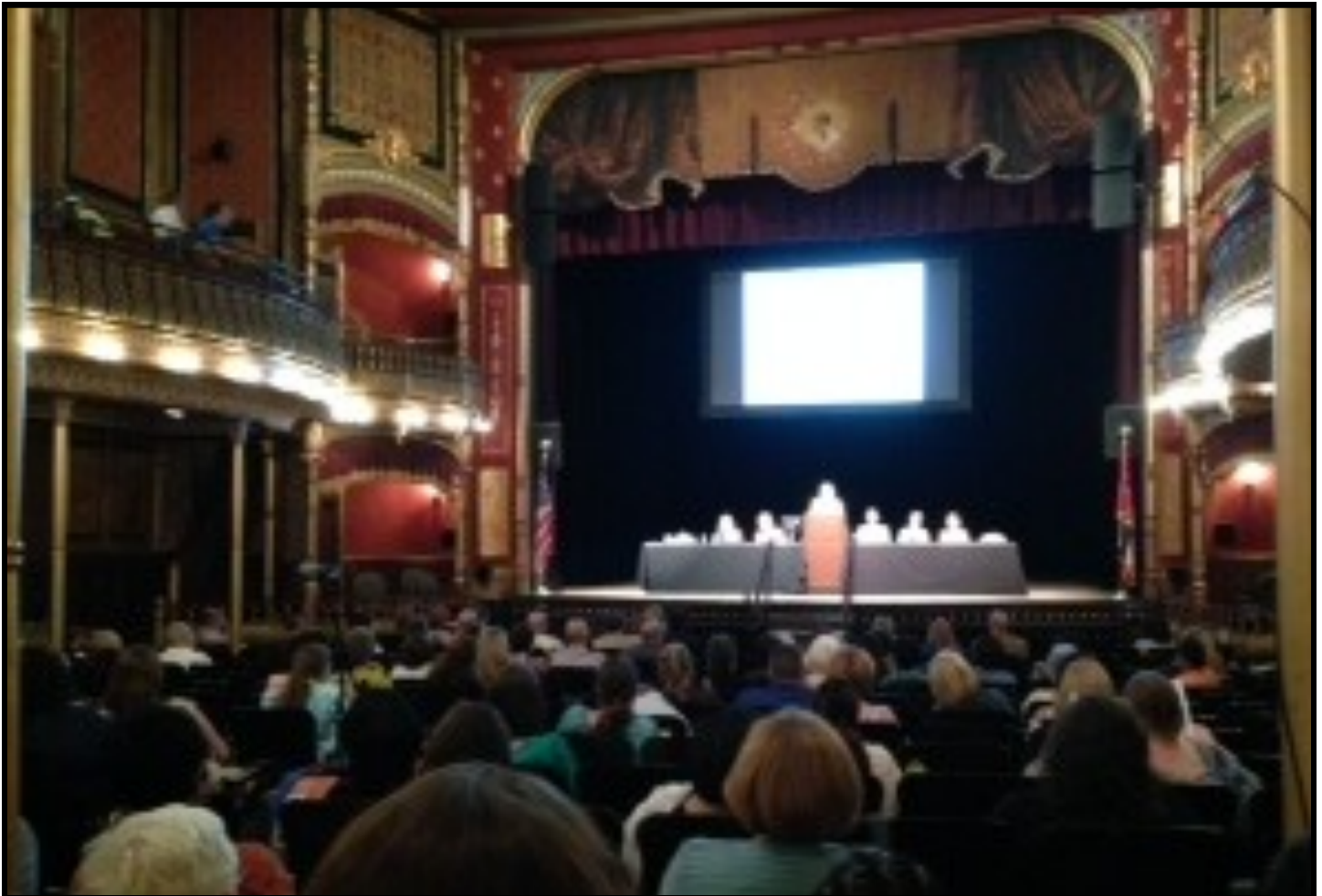
Attendees of the 15th Annual Alzheimer's Conference watch presenters on the stage of the MSU Riley Center where the conference was held.