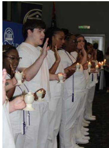
Copiah-Lincoln's Simpson County Center held its July LPN Pinning Ceremony in Boswell's Auditorium. Graduates, several of whom have expressed an interest in coming to work for Boswell after passing nursing boards, are pictured with their symbolic lamps, left, and below, on the front steps of the Auditorium.