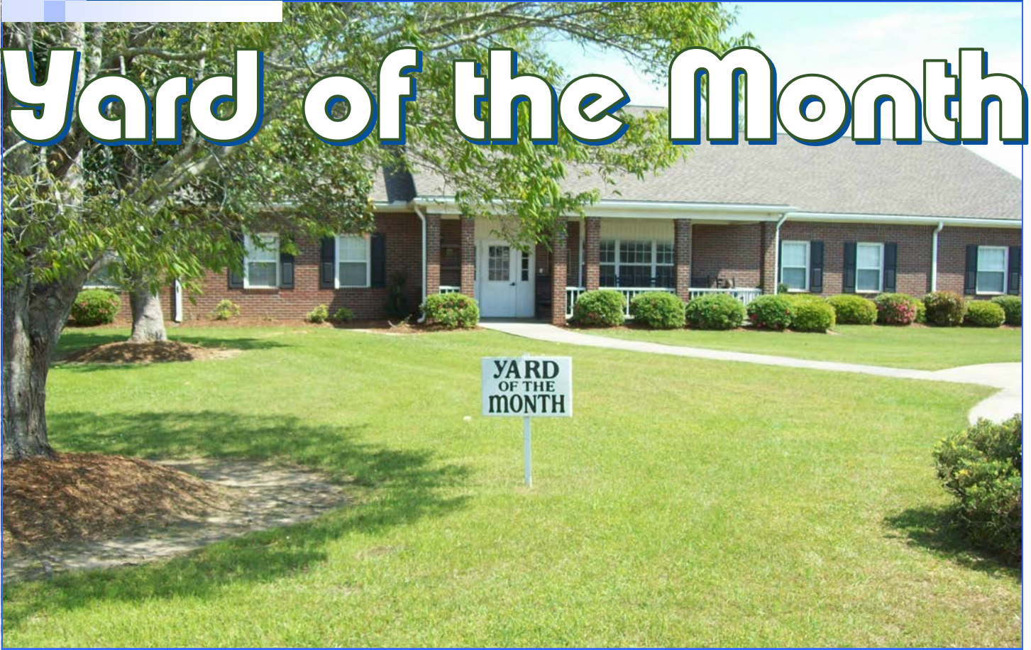
The Wesson Geriatric Group Home was selected as Yard of the month for April by the Wesson Garden Club.