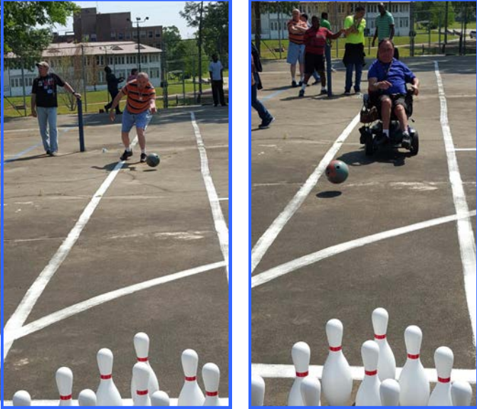
The Special Olympics qualifying games were held at Green Park on April 9th.