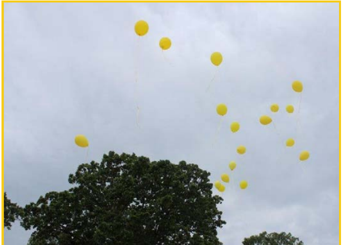
Staff and close friends of C. Osborne released yellow balloons in her memory. Yellow was her favorite color!