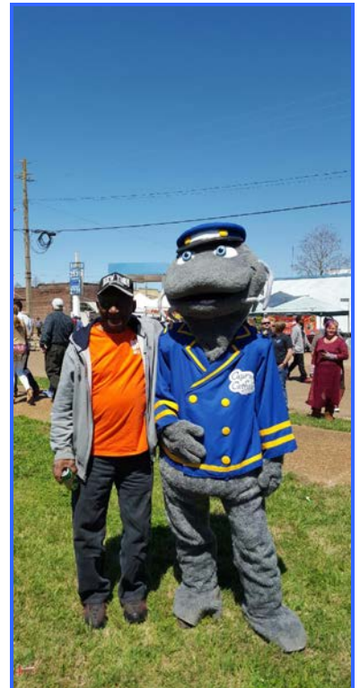
Some of the people served by Boswell Regional Center recently went to the Catfish Festival in Belzoni.